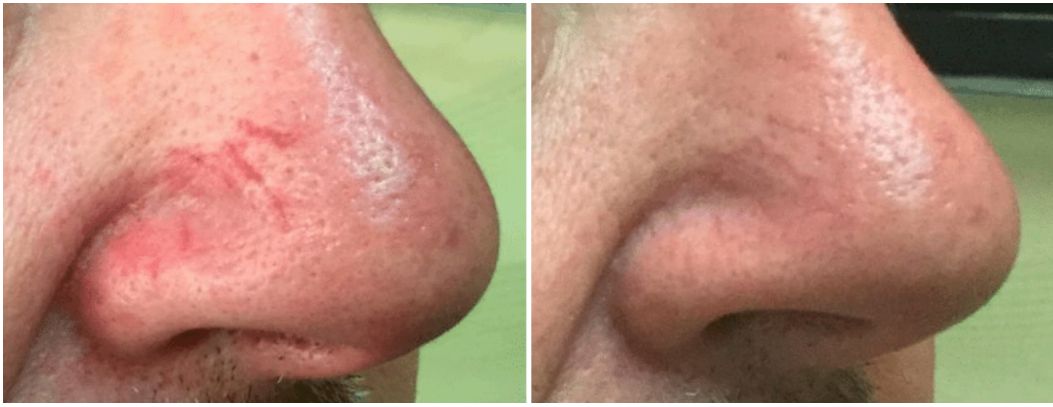
Broken Capillaries Before and After