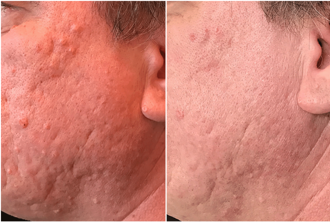
Sebaceous Hyperplasia Before and After