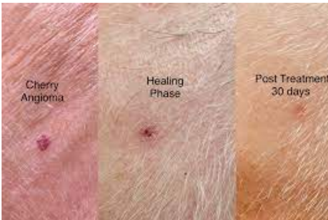
Cherry Angiomas During Healing

Reminder that outcomes for skin irregularity treatment can never be guaranteed. Every skin heals on different timelines and can have different responsiveness to treatment. Some imperfections may require more than one treatment.